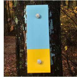
The new Blue / Yellow plastic trail markers